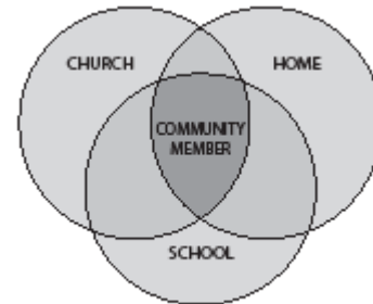
Figure 1 - Identity of Each Community Member

a community school model. Rather than seeing the church, home and school as separate institutions that work together, it is understood that these three words refer to three different aspects of each member's own identity (Figure 1). Christians are familiar with the metaphor used throughout the New Testament that describes the community of Christian believers as the "Body of Christ." There are many passages that discuss the different parts of this Body, the diversity of gifts and function that are ascribed to each, the importance of working together, and a common faith that binds us together in unity.